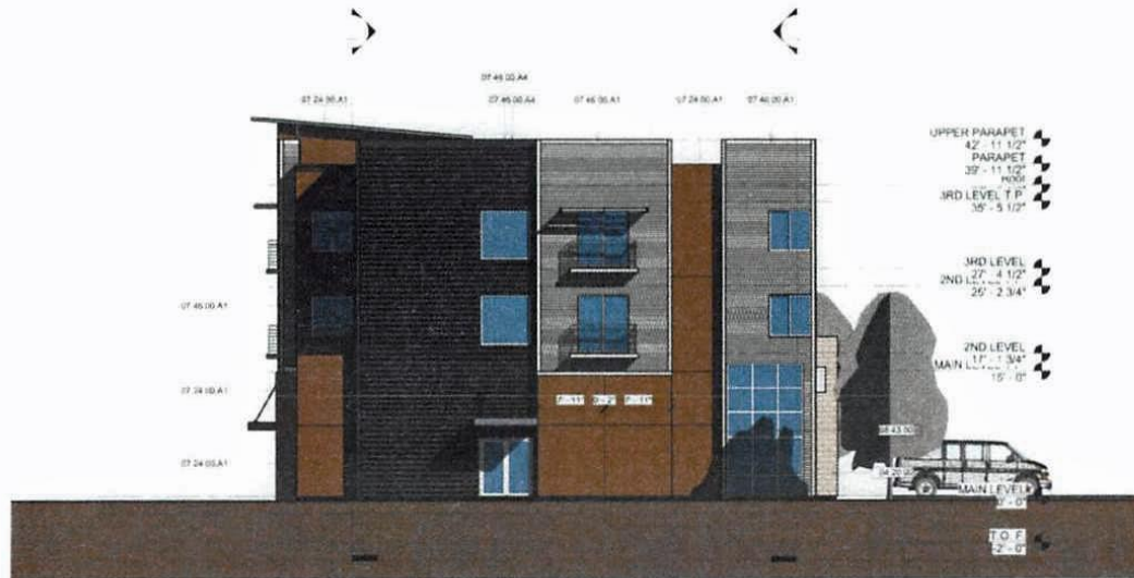
1. West 1/8" = 1'-0"