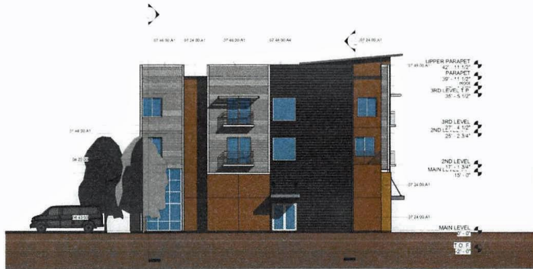
2. East 1/8" = 1'-0"

TDR The Developers Resource, LLC 1061 East 143 North, Lindero UT 84042 P: 801 706 0144 F: 801 746 6887 www.tdr-llc.com