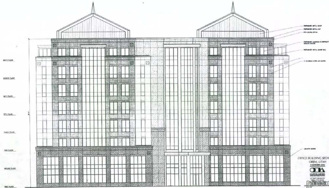
NORTH ELEVATION SCALE: 1/4" = 1'-0"

OFFICE BUILDING SCHEMATIC OREM, UTAH 8 NOVEMBER 2006